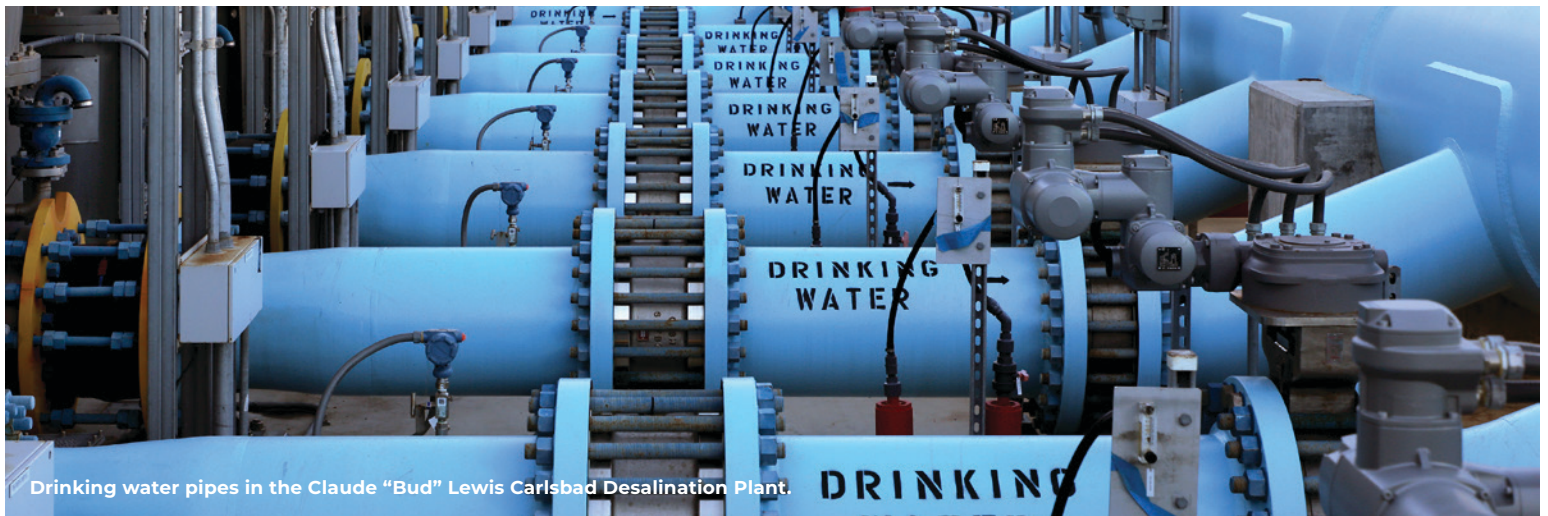
Drinking water pipes in the Claude "Bud" Lewis Carlsbad Desalination Plant.